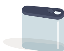
CULTURE MIX DISPENSER