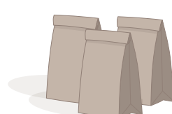
CULTURE MIX (3)