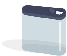
CULTURE MIX DISPENSER