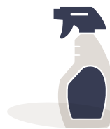
SPRITZ BOTTLE FOR DILUTED ACCELERANT